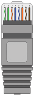
Top View of RJ-45 Connector